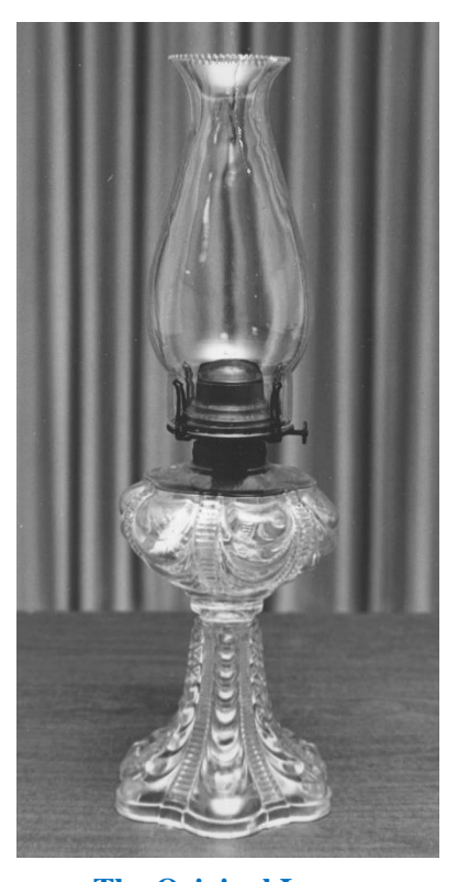
The Original Lamp October 2, 1913

When those 35 Colored Railway mail clerks met at the foot of Lookout Mountain, I doubt that even they would have foreseen the avenues that we would have trespassed getting to this day. In truth, neither did I, and I came along a few years later. There was a call of necessity back in 1913 that had it went unanswered, our story could and would have been much different then it is today. As a viable